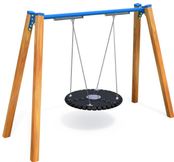
Rubber membrane solid basket swing option