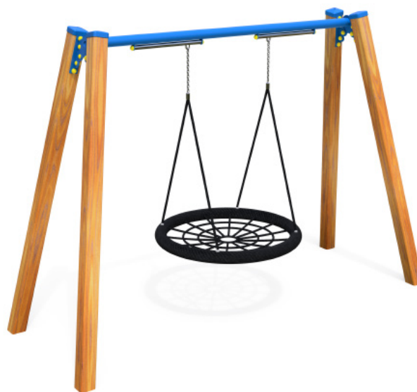
Rope nest basket swing option