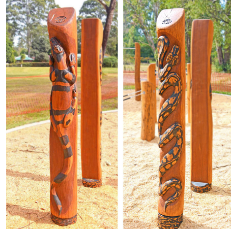
Carving is available for an additional cost.