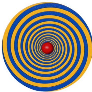
Spiral Spinner PN60