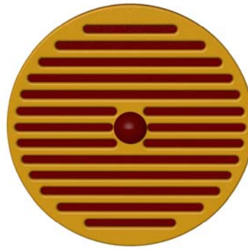
Illusion Spinner PN760