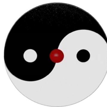
Yin-Yang Spinner PN763