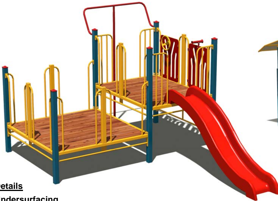
Shade roof option